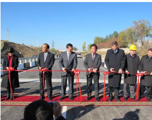
The Alamedin bridge opening ceremony