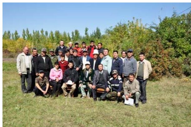
Training participants at the Chui Forestry Farm