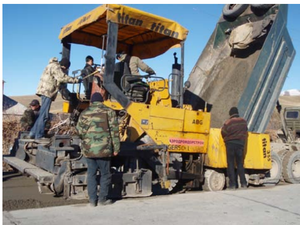
The road laying process

Japan's experts shall pave a new way to construction of similar roads in other regions of the Republic as well. (Suyunaliyeva Guljan)