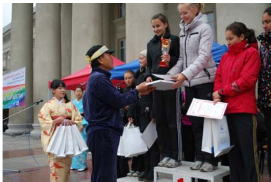
The Ambassador of Japan presents the prizes to the winners

Overall, the program was very interesting and full of the elements of Japanese culture: right before the beginning of the opening ceremony, the Ooedodaiko drummer group performed compositions