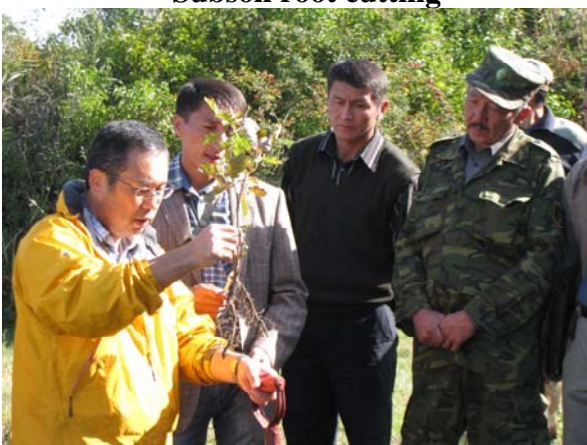
Root system development