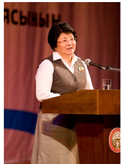
The speech of the President deeply touched our hearts