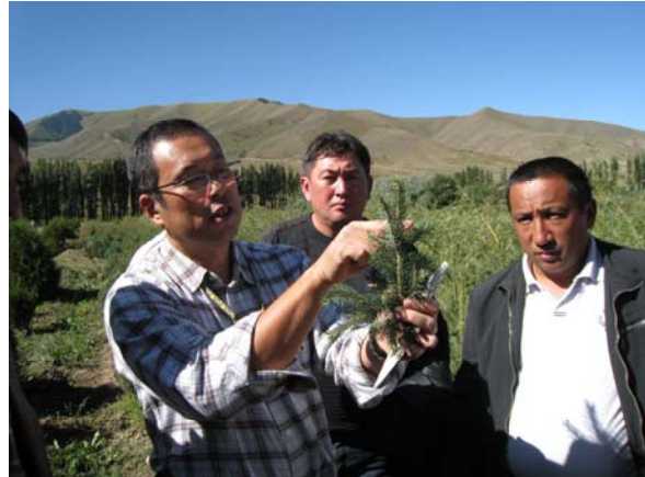
Selection of a graft