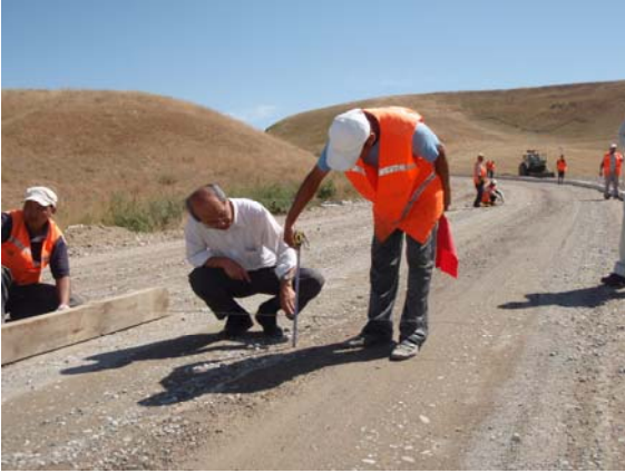
Preparatory works at the pilot section of the road

The project envisaged replacement of a 1.0 km-long road section's existing asphalt surface with the concrete one. The main goal of this pilot project was to study and transfer the cement concrete road surfacing technology as well as to test materials used in installation of such surfaces, including filling and additive materials used in the concrete mix. Well before the commencement of the pilot project, MT&C experts, under Mr Kawakami's guidance, had selected the composition of the concrete mix and completed installation of an experimental length of the concrete surface in the territory of the Reinforced Concrete Manufacturing Plant in Bishkek. In