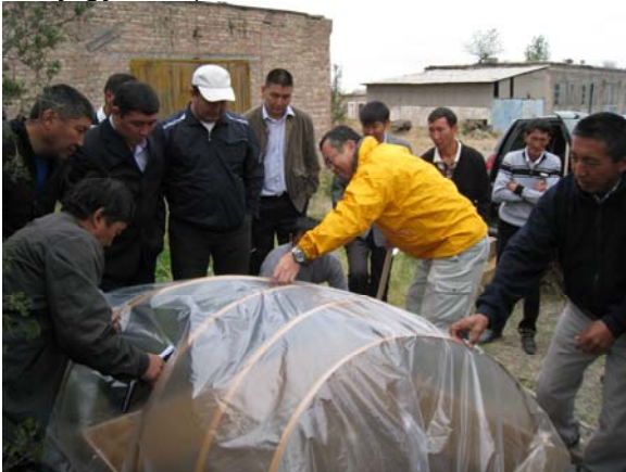
Sample micro-greenhouse demonstration