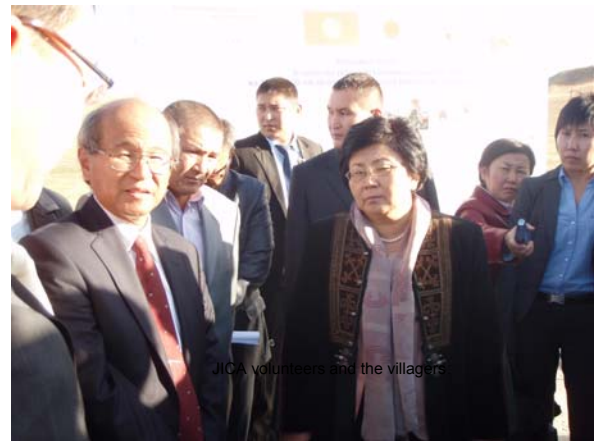
The visit by the President of the KR Mrs R.Otunbaeva

The uniqueness of this project is its being the first pilot project on concrete surface installation, since, as a rule, asphalt surface technologies have been used in road construction in Kyrgyzstan. There are several advantages in using concrete surfaces. Firstly, the longevity of the road because with asphalt road surfaces capital repairs need to be done once in five years, whereas with a concrete surface the road is in need of no repairs for 30 to 50 years.