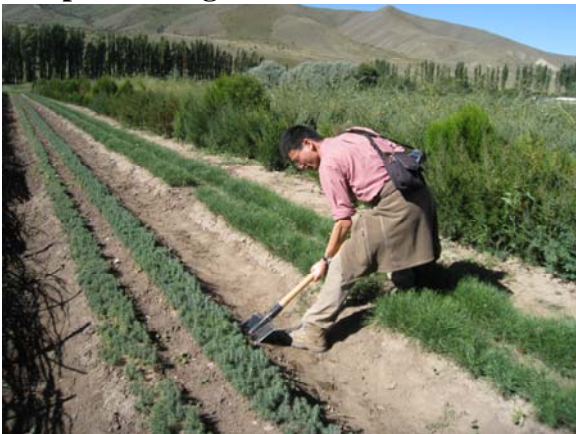
Subsoil root cutting