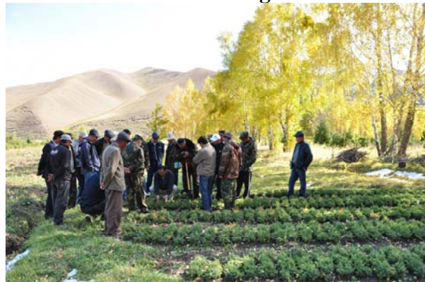
Thinning out seedlings