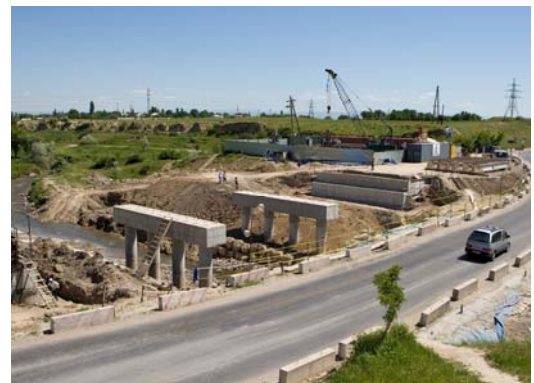
The bridge construction process