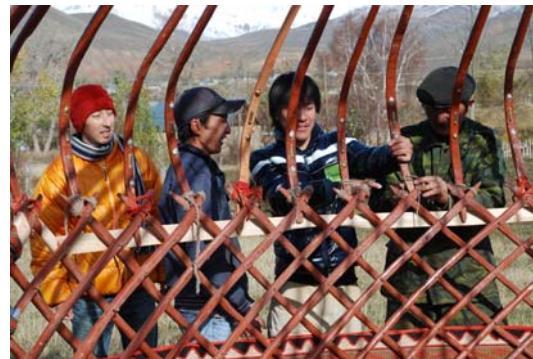
JICA Volunteers and villagers

It was a clear and sunny day on October 24. Early in the morning 26 JICA volunteers arrived in the village of Alysh. Jointly, we set up the yurt , slaughtered and prepared the lamb, made the boorsoks , and did many other things that could be surely attributed as some genuine rural life sampling. Numb-cold hands or the language barrier did not prevent the volunteers or villagers from making joint preparations for the festival, with merry laughter of the people coming from everywhere.