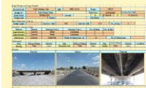
Bridge passport data

Latest news on Bridge&Tunnel Maintenance Project