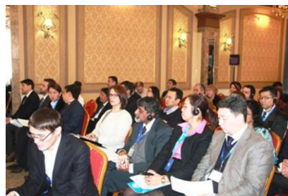
Ministerial conference participants

Disaster Risk Reduction; Framework of Cooperation and Plan of Action on strengthening regional collaboration for Disaster Management Authorities of Central Asia and the South Caucasus in the area of Disaster Risk Reduction. ●