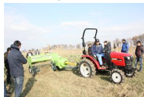
In the field

Following the event, the demonstrated machinery was granted to the Agrarian University and will be used in the training program of the Engineering Faculty for training machine operators and engineers of agricultural machines. ●