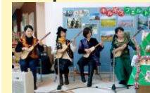
Komuz melody in Japan