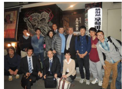
Participants of Conference

know about Kyrgyzstan, but now I know that Kyrgyzstan has good opportunities to attract foreign tourists with its abundant nature. I wish for the development of tourism in Kyrgyz, and I hope this business trip becomes a cornerstone for it. ●