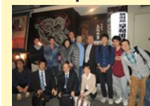
Participants of Conference

Demonstration of Japanese agricultural machinery