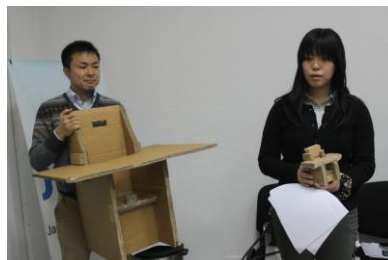
JICA volunteers presentation