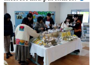
An interest from Japanese customers

JICA HQ officers and former JOCVs, who had worked in Kyrgyzstan, rendered assistance in our sales promotion activities in Japan. The OVOP Association and its producers expressed great gratitude to NEXCO for their cooperation, to JICA HQ & former JOCVs for their great support, and to Japanese consumers for their interest and purchases. ●