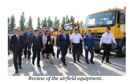
On June 29, under the grant project for improving the equipment of "Manas" airport, a ceremony of transfer of the air navigation system took place. The ceremony was attended by JICA President, Mr. Shinichi Kitaoka, who was in Kyrgyzstan on a two-day visit, and the Prime Minister of the KR, Mr. Muhammetkaly

Abulgaziev. The airport's air navigation equipment supplied under the Japanese loan in 1999 served the recommended period and had to be renewed in order to meet flight safety standards.