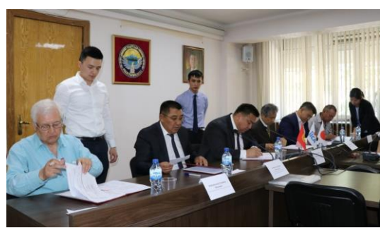
Ceremony of memorandum signing.

The ceremony for the signing of the Memorandum of understanding on the establishment of the Trade Logistics Center of local type (LTLC) in the Kochkor district of Naryn region was held. The memorandum has been signed by the parties implementing the pilot project for the promotion of agriculture logistics through the establishment of LTLC. The main goal of the pilot project is to develop the business model of LTLC based on the agricultural cooperative.