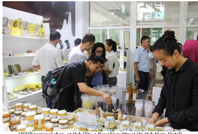
OVOP regional shop, at Osh City, 1 Bayalinov Street (In Osh Nuru Hotel).

The first OVOP Store") was opened in with donor organizations apricot, cosmetics prod-Osh. The Opening Cere- such as WFP, UNDP, ucts, organic cotton yarn, mony took place on July Helvates in Osh, Jalal-3, 2018, in Osh city, where Abad and Batken oblasts. representatives of local After the explanation of authorities, OVOP Com- each new product, the mittee members of Osh guests had a chance to oblast, representatives of taste the food products; donor organizations, pro- they especially liked aiwa ducers and other related jam made from local parties were invited.