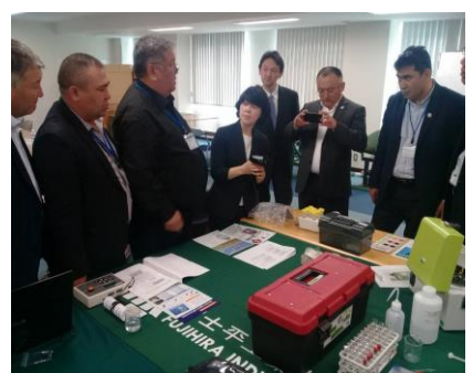
Visit to the Fujihira company that produces the mini kits/equipment for livestock husbandru.

A training on the "Improvement of Technologies and Systems of Veterinary and Animal Husbandry for the Production and Distribution of Raw Milk" organized by the JICA project for Market-Oriented Milk Production in Chui Province (MOMP) was held in Japan. 11 representatives of the dairy sector from Kyrgyzstan took part in the training. Participants were familiarized with Japan's experi-