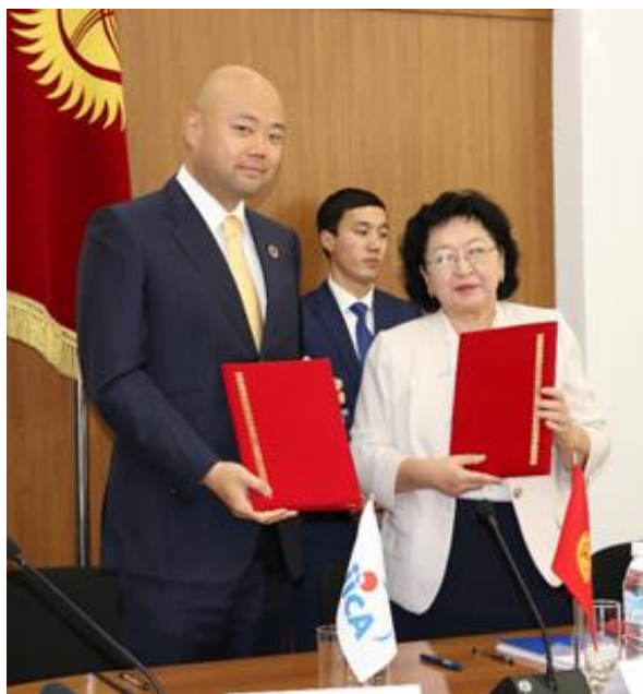
Signing ceremony for grant aid project.