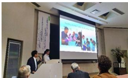
OVOP Kyrgyz Presentation.

On July 6 th , 2019 the «One Village One Product» project and the Public Union «OVOP+1» took part in the International Aizome Forum (Aizome is traditional Japanese indigo color paint) organized by Shikoku University in Tokushima Prefecture. Tokushima Prefecture, located in Shikoku region in Japan, is known for Awa-Ai, a traditional Japanese indigo dye technique, better known as “Japan