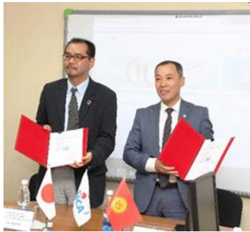
During the ceremony.

On the 12th of July 2019, the handover ceremony of equipment for the distance Education (DE) was held at the Training Center within the joint project of State Tax Service