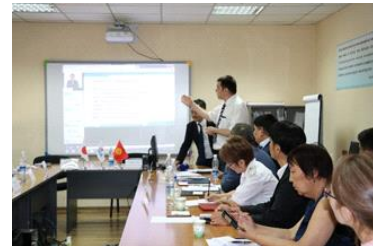
Demonstration of the DE.

The main goal of the project is to improve the development of potential of STS personnel and increase the tax literacy of the population through the introduction of distance learning. ●