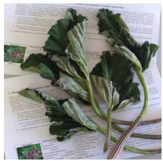
Burdock – medicinal herbs, growing in the Kyrgyz Republic

A participant of the training, a member of the Karakol forestry enterprise, expressed his gratitude to JICA and said: "Thanks to this training we learned how to properly harvest and dry herbs, and HACCP requirements. After all, the purpose of the leshoz is to attract local forest users to collect and dry medicinal herbs and wild berries for sale, which will be their additional income and improve their economic status."