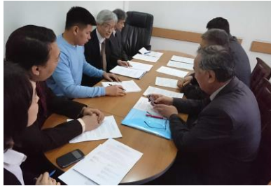
During the signing ceremony

On December 9 th , JICA met with the representative from the Ministry of Economy, the State Inspectorate for Veterinary and Phytosanitary Safety under the Government of the Kyrgyz Republic and the Disease Prevention De-