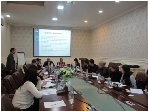
During the seminar

Two seminars were organized for the mission visit from JICA head office, the Department of Industrial Development and Public Policy. One seminar was organized for the staff of the Ministry of Economy of the Kyrgyz Republic in which the history of politics in relation to small and medium-sized enterprises of Japan and the policy development for small and medium-sized en-