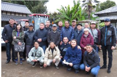
During the trainings

From November 15 th to December 4 th , 2016, 14 Kyrgyz farmers attended a three-week training course in Japan and Thailand. The training course was organized as a part of the capacity development activities of the Project for Promotion of Exportable Vegetable Seed Production, which aims to producing vegetable seed in Kyrgyzstan and export them to seed companies around the world. Prior to their training course, since April