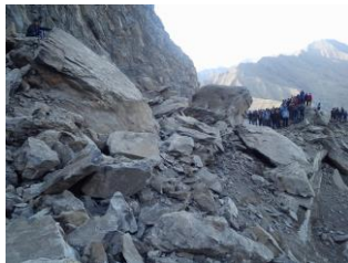
Rock fall on Bishkek-Osh Road

Many roads in the country located along mountainous slopes have suffered from different types of natural disasters, such as avalanches, rock slides, snow drifts, etc. which cause a variety of problems for people, the economy and traffic in Kyrgyz Republic. For the example, the Bishkek-Osh (BO) Highway has had many sections close down annually due to rock falls (section at 400 km and others), avalanches (section at 246km and others), and snow drifts (section at 125-129km near "Too-Ashuu Pass" and section 216-222km near "Ala-Bel