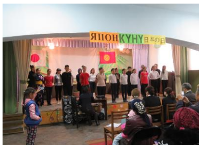
Japan culture day in Naryn

I am working 300 km from Bishkek, 2300 m above the sea level, in the high mountains area, of Naryn City, at the Children's Education Center as a teacher of Japanese language and culture. On May 12, 2016 the children, studying Japanese language, celebrate a Japanese Culture Day where they showcased their progress to all their guests. It took 1, 5 months of preparation. My colleague and I divided the students up into groups and each group ap-