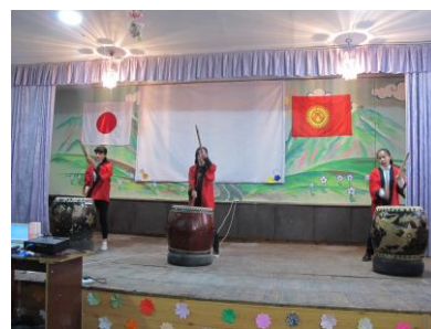
During the concert