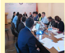
Participants of meeting