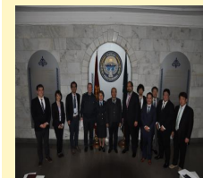
State Tax Service, "Digital Knowledge" Company and JICA Representatives