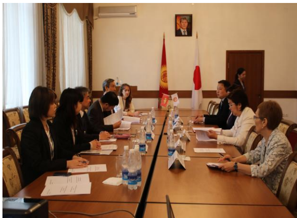
Joint Coordinating Committee Meeting

The Kyrgyz-Japan Center for Human Development Project (KRJC) and the results of its activities in previous years (2003-2015) have been highly appreciated by the business community in Kyrgyzstan. Starting on April 1 st of this year the project entered into a new 5-year phase. Now we are facing new challenges creating a stable institutional mechanism and a Center for the development of human resources. We plan to reach these goals, while continuing to learn from the experience and technology of Japanese experts. The support of Japanese experts is very important to us in order to implement the following new programs: business courses in Tajikistan aimed at promoting regional cooperation in Central Asia, and assisting in the internationalization of students from Japanese