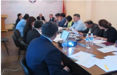
Participants of meeting