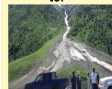
Avalanches risk area