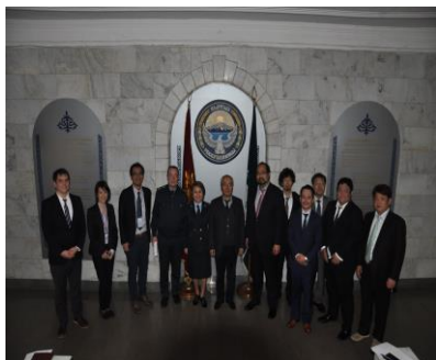
State Tax Service, "Digital Knowledge" Company and JICA Representatives

JICA is now collaborating with the State Tax Service on a new project, to improve the human resource development system in the country.