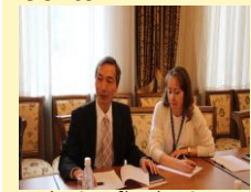
Joint Coordinating Committee Meeting