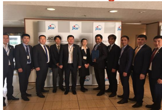
Participants of training in Japan

On May 12 th a report meeting was held with participants of the JICA training course, specially created for the KR called: "Capacity building for PPP Projects Structuring", which originally was held in February 2016, in Japan. Nine people were in attendance - representatives of various government agencies, including the responsible authority for the implementation of PPP projects in the Government - Investment Promotion Agency under the Ministry of Economy